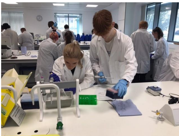
(Students adding the reagents to the PCR tube).

The students then carried out electrophoresis in order to visualise and analyse their samples.