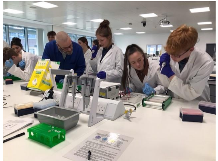
(Students loading the electrophoresis gels).

The students then carried out electrophoresis in order to visualise and analyse their samples.