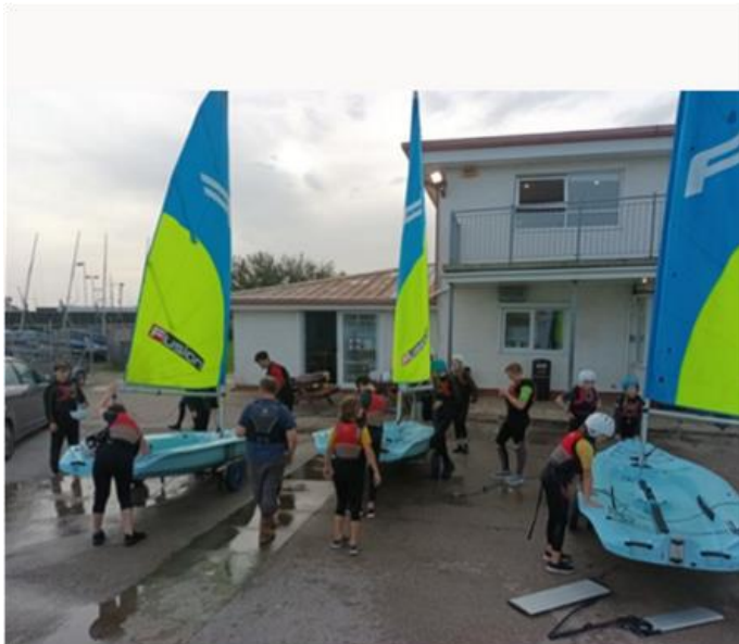
Cadets started off by learning how to rig a Fusion sailboat.